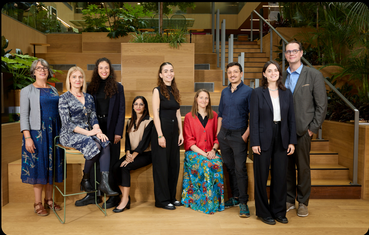
2BS Team Picture

Continuous evolution is in our DNA. This is why we work hand in hand with experts from the agricultural world to develop specifications that meet not only regulatory requirements but also the reality of the field.